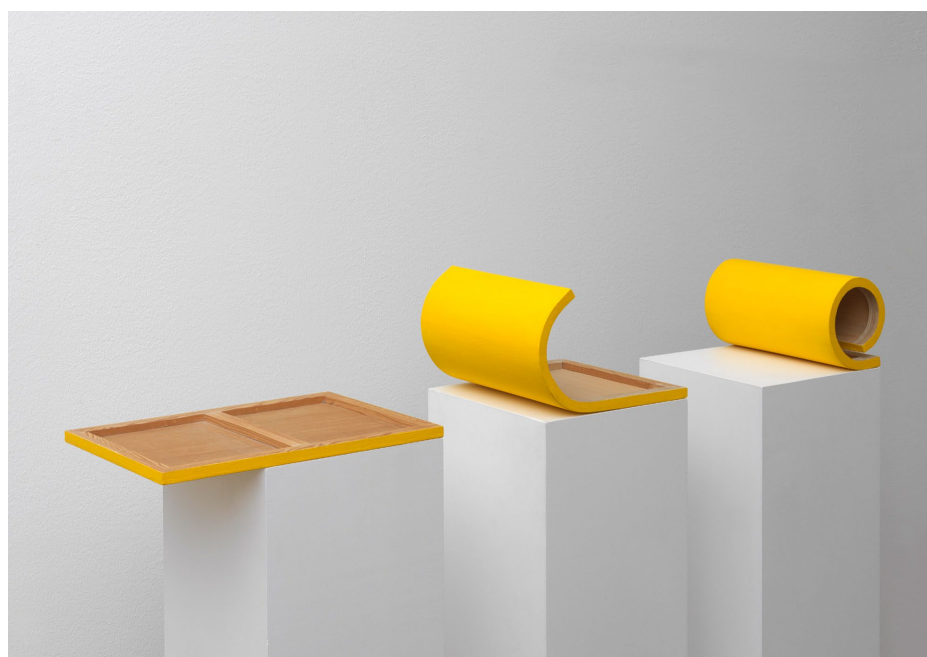
vloop , 2003, acrylic on canvas and wood, 3 elements and 3 pedestals, 108 x 33 x 33 cm (approx.) x 3.

The French artist André Stempfel (1930) is an inspired and ingenious practitioner of monochrome geometries. Since the 1970s he has focused almost exclusively on one color—yellow—and has made the yellow monochrome richly pictorial, signifying, and objective all at once. TMH is pleased to collaborate with the artist on his first solo show in Amsterdam, which assembles nearly 70 works. A tribute to his extraordinary 50-year practice, the show presents an opportunity to rethink painting, sculpture, and even architecture from the perspective of minimalism. For more information: www.merchanthouse.nl