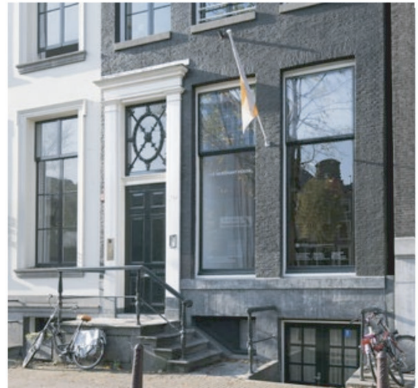
Façade of TMH with the Flag of Compassion of Rini Hurkmans